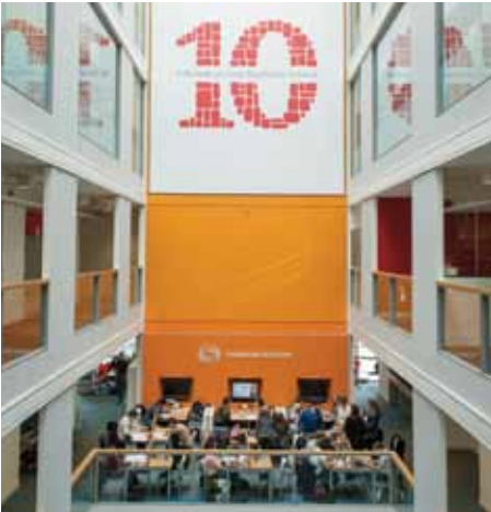
Celebrating ten years as Cass Business School

“I have nothing but fond memories of my two years at Cass, or CUBS as we knew it then. My MBA helped provide a more rounded education and I had the privilege of being taught by some excellent teachers. In many cases, there was just as much to learn, theoretically and practically, from my fellow students, a number of whom have become lifelong friends.”