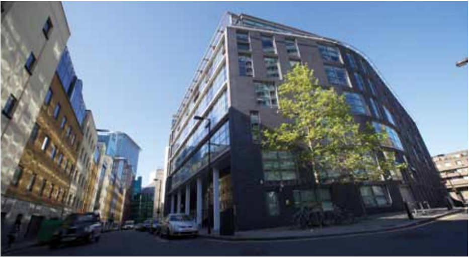
Cass Business School at Bunhill Row