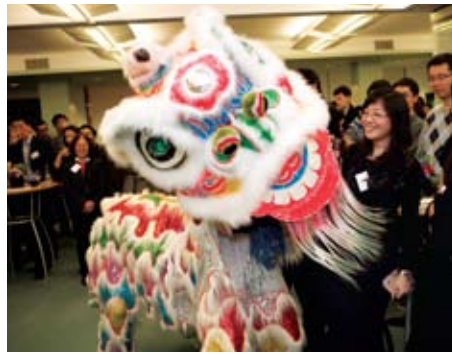
Left: TANC event 2010